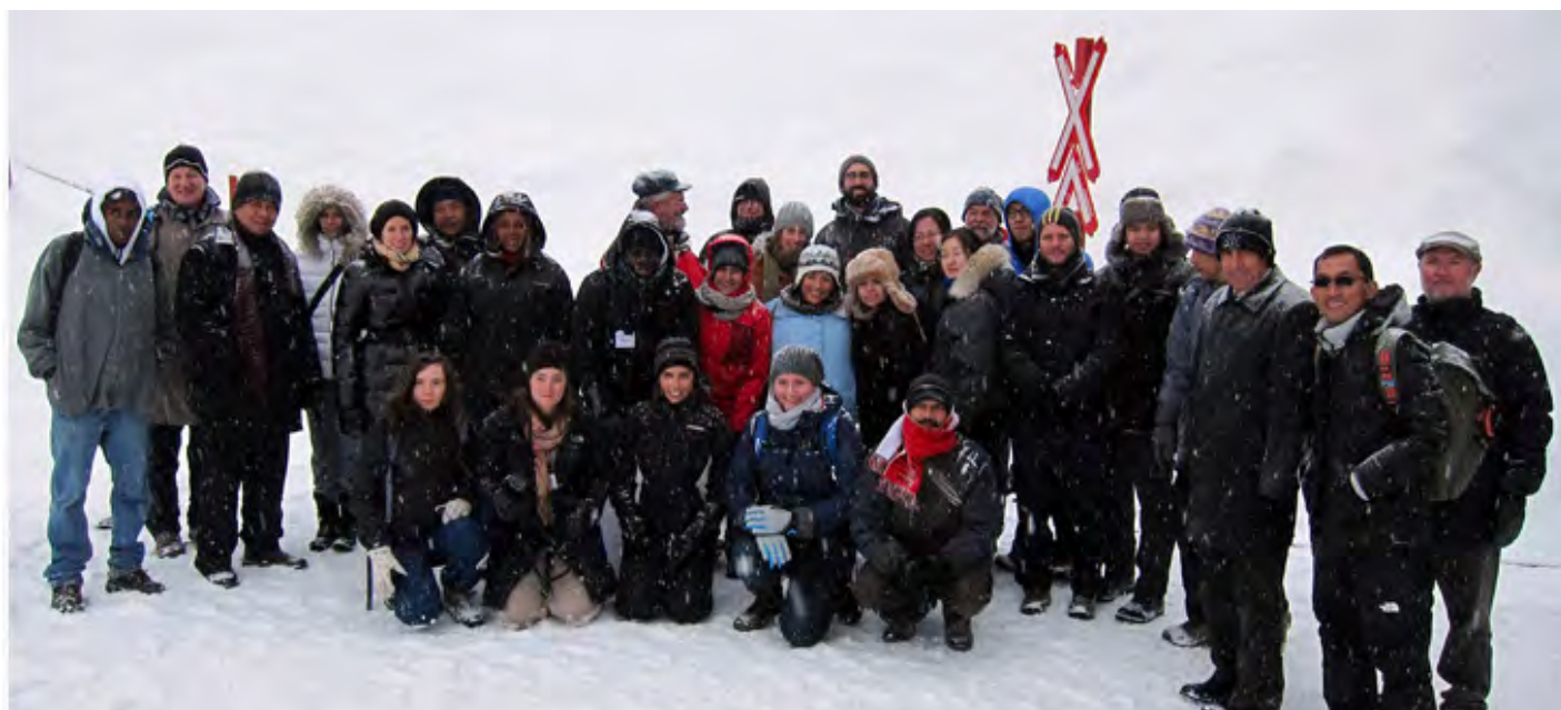
Field trip: Lauterbrunnen - Mürren: A walk in the snow with glimpses at the landscape