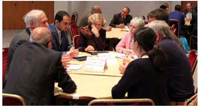
World Café: Discussions and exchange on key issues for the future of forest landscapes

the economic costs of good governance; maintaining the independence of science; corruption; and linkages with other sectors.