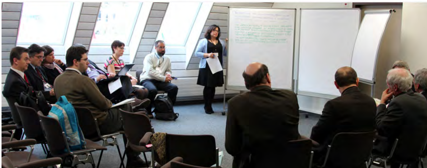
Facilitator Ivonne Higuero, UN Economic Commission for Europe (UNECE)

Lively discussions ensued with questions related to managing forests within a green economy; evaluating the spiritual, cultural and aesthetic values of forests and accounting for biodiversity hotspots; reaching out beyond the forest sector; private sector impacts including the role of banks; and monitoring, reporting and assessment methodologies.