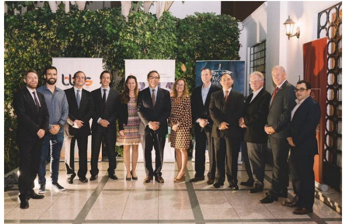
Launch of PECAP May 2017

In the following years, new angel networks appeared, and Swiss EP began connecting them with other ecosystem actors. Based on the success of this early work, Swiss EP facilitated the creation of an association of angel networks, PECAP (Peruvian Seed and Venture Capital Association). Swiss EP helped by setting up space for 5 angel networks to meet up on a monthly basis, coordinating their activities and expanding their outreach. PECAP was announced in May 2017 at a cocktail party at the Residence of the Swiss Ambassador in Peru.