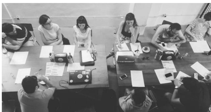
Startup Macedonia in action

Only a few months later Startup Macedonia was officially registered with the objective to map, track and support the local ecosystem, and represent the ecosystem in front of third parties, such as the public sector in Macedonia. As a Swiss EP partner organization, multiple international experts have offered strategic and operational support to Startup Macedonia.