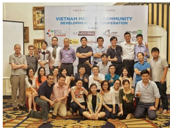
Launch of VMI in 2016

When Swiss EP kicked off in Vietnam in late 2015, there was a lot of interest in entrepreneurship and startups and several new accelerators and incubators were getting started. The awareness in the ecosystem about entrepreneurship was still minimal, but much curiosity existed around it. One aspect that was frequently discussed was business mentoring, although there was no common understanding of what that meant. Potential mentors did not know how to get involved, or even that there was a need and an opportunity for being involved. The one organization that supported and trained mentors, SME Mentoring, put equal importance on business mentoring, career mentoring, and even mentoring students with their school work. The programs Swiss EP worked with, such as Hatch and DNES, would equate lecturing/advising with mentoring, and were afraid to go and invite potential mentors to participate in their programs. Coaching is "lecturing" if you will. Telling people what to do and how. Mentoring is listening, discussing, asking questions. It is not telling people what to do. Both are important aspects of accelerator and incubator programs, although effective long term mentorship is the most closely aligned with success of the entrepreneurs and startups.